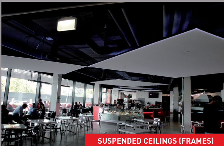
Restaurant Léopold (Switzerland) - Architect: Ti-gel - Installation: Decolab