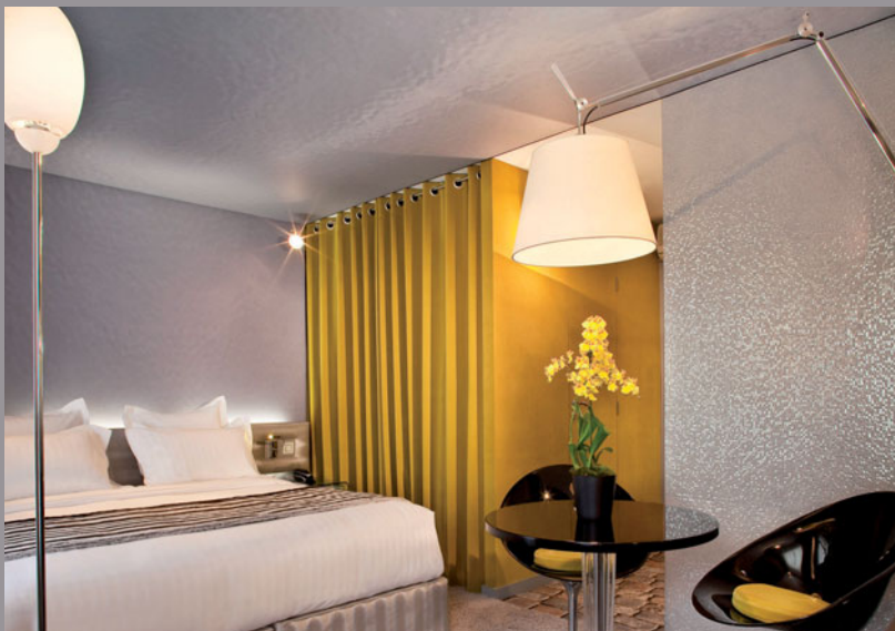
Hotel Eiffel Park (France) Installation: Silva Création