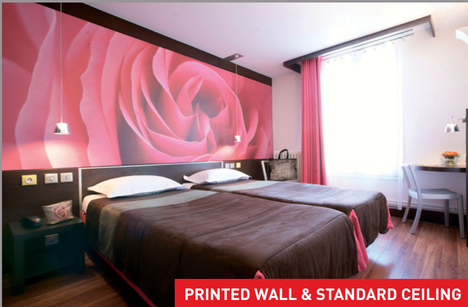
Hotel du Parc (France) - Architect: Fabrice Antore