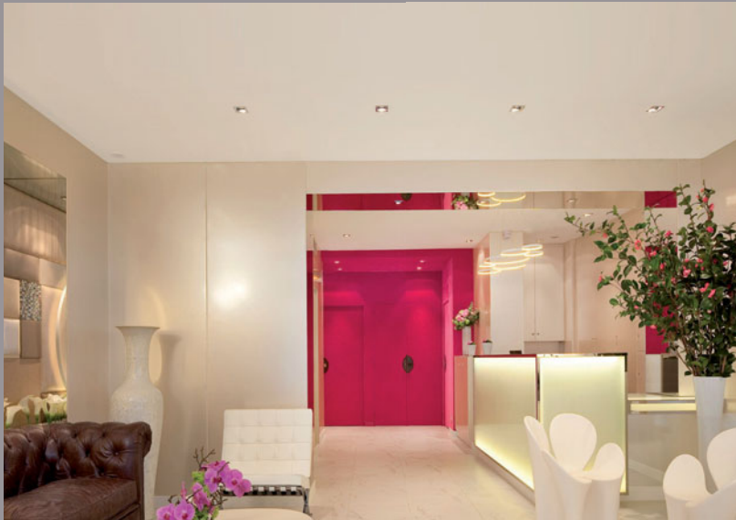
Hotel Eiffel Park (France) Photos: Christophe Bielsa for hotel 7Eiffel - Installation: Silva Création